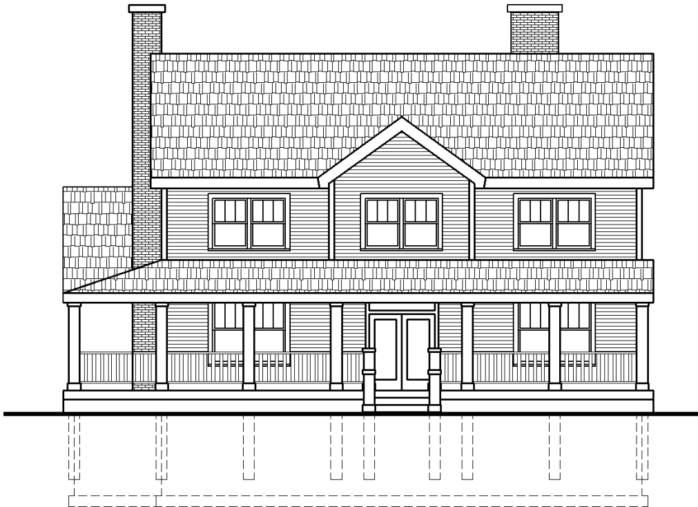
Exterior Elevation Created in Chapter 5, utilizing blocks, hatching, line weights and line types.